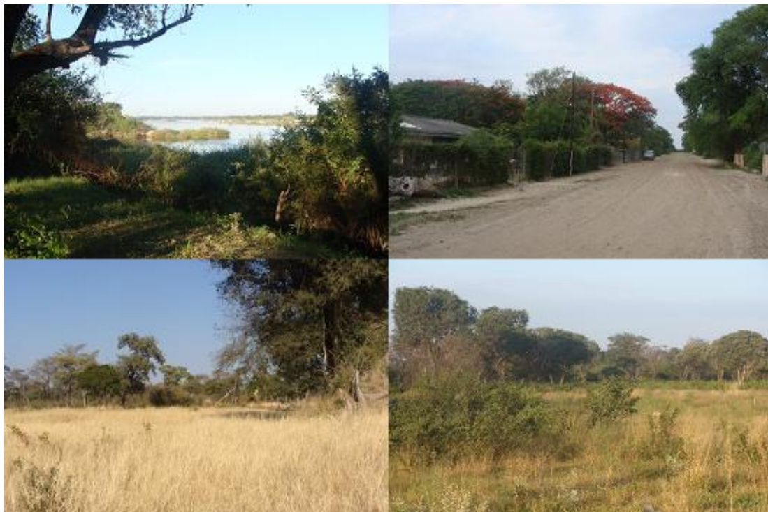
Fig 2-5. The study area.