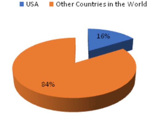
Fig3. Covid-19 Death Toll of USA versus All the Countries in the Word

The pandemic has to a great extent impaired the military prowess of USA and drastically hindered its level of alertness worldwide as manifest in the incidences of USS Theodore Roosevelt aircraft carrier quarantined in Guam sequel to the siege of Covid-19 on the sailors. The statistics of U.S. Department of Defense, with respect to service members that have been infected, hospitalized and death is not encouraging. Heavy infection rate on US armed forces has the propensity of hampering its operational capacity by ill-health or death. As the world's superpower, a lot of countries look up to USA in times of willful aggression but Covid-19 is negatively impacting on its ability to create security in the international arena [16]. This is apparently, emboldening over-ambitious countries like Russia to commit acts of aggression against Ukraine despite its membership of NATO.