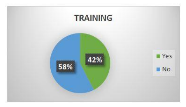
Figure 4. Respondents who were trained after joining village banking

Figure 4 shows those respondents that went through training and those that did not. The majority of respondents 23(57.5%) indicated that they had not undergone any training whilst 17(42.5%) had undergone training in entrepreneurship, management, business and marketing. The majority of those who had been trained had been members of village banking for more than five years.