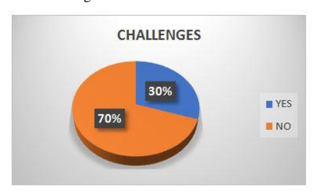
Figure 2. Respondents who faced challenges

Respondents were asked to indicate if they had faced any challenges after they joined village banking and their responses are shown in the figure bellow: