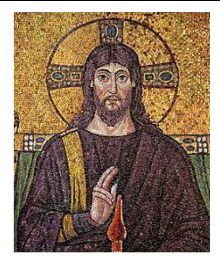
Fig. 1. Sixth-century mosaic in Sant'Apollinare Nuovo, Ravenna. It portrays Jesus long-haired, bearded, and attired