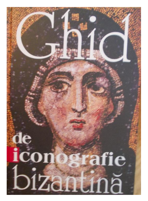
Fig. 7. A contemporary Hermeneia written by Constantine Cavarnos, Guide to Byzantine Iconography, Boston, MA , 1993 in its Romanian translation as Ghid de Iconografie bizantină.

Closing here with more theoretical lines about memory, we shall mention that historically there have been two main competing views regarding the nature of the realities that constitute the subject of memory: one which see these as they are, and one that holds that memory functions by representing objects . As it is to be expected, the first stance is called direct realism, and the second indirect or representative realism. With respect to Byzantine artistic works one can say that their creators are representative realists in the sense that for them what they paint is mainly the result of their thoughts.