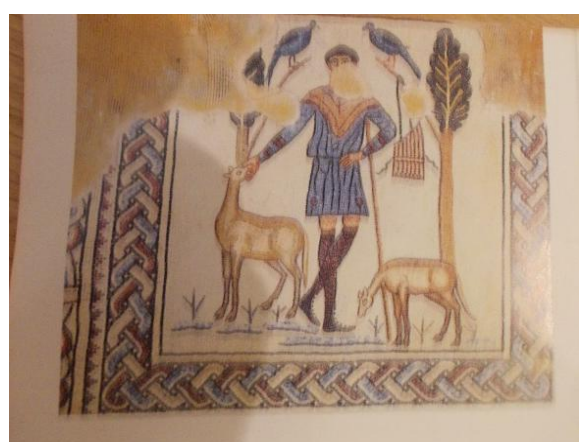
Fig. 2. A representation of the 'Good Shepherd' within the Domus dei Tappeti di Pietra (The Domus of Stone Carpets), Ravenna. As one can see, this is different from any other classical representation of the same iconographic motif; sixth century. Photo taken by EED-Vasilescu, June 2021 in Ravenna.