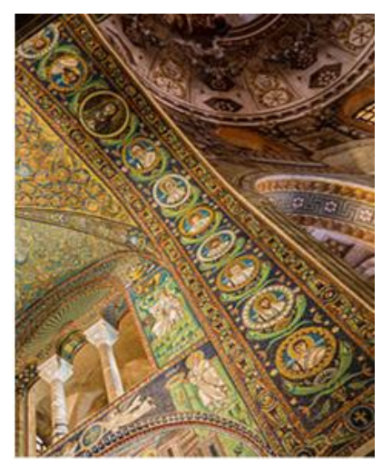
Fig. 4. The mosaic of the triumphal arch. Basilica of San Vitale; Ravenna. 548 AD