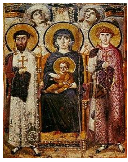
Fig. 3. Icon of the enthroned Virgin and Child with saints Theodore and George and angels, sixth century, Saint Catherine's Monastery, Sinai; encaustic on wood, 2' 3" x 1' 7 3/8"/68. 58 cm x 49. 7 cm. Source: Elena Ene D-Vasilescu, "The Fourth Century Theotokos Icon of the Temple Gallery", in Byzantinoslavica 65, 2007, p. 90 [pp. 83-90].