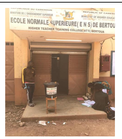
Photo plate3. Hand washing facilities on the campus of HTTC Bertoua