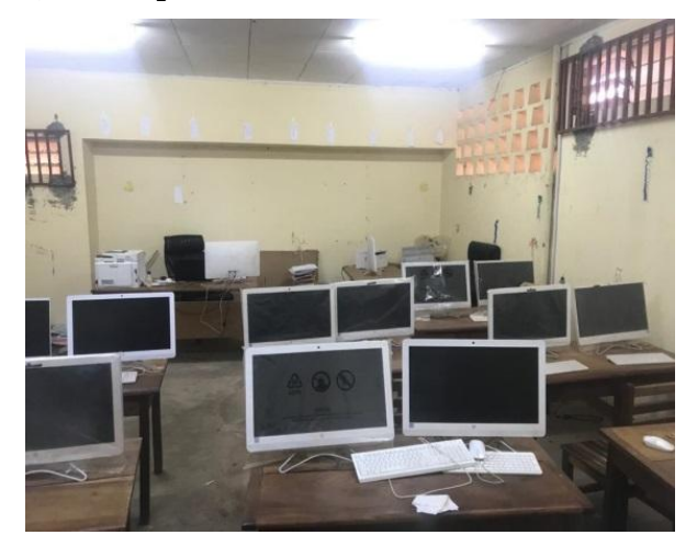
Photo plate2. Ranges of computers located at the CRTE of ENS Bertoua.

Awareness: the computer is used by the teacher outside the classroom for his own use. At HTTC Bertoua, almost all permanent teachers have a laptop for research related to courses and scientific publications, except for the temporary teachers questioned (35%) who did not personally have one, but used the laptops present at the Center of Resources for Educational Technology(CRTE) (Photo plate: 2).