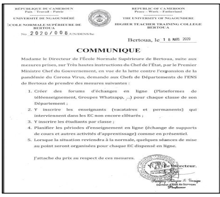
Photo1. Communiqué from the Director interrupting face-to-face lectures at HTTC Bertoua. This following the very high instructions of the Head of State, by the Prime Minister Head of Government, with a view to the fight against the expansion of the Corona Virus pandemic.

This day of Tuesday, March 17 was confused for the populations, because among the thirteen measures aimed at thwarting the spread of Covid-19, the closure of schools and universities prominently. Bertoua's higher teacher training college has followed the same sagacity by obstructing a series of decisions, including the Director's decision to close the said school and the establishment of an online learning system ( Photo: 1 ).