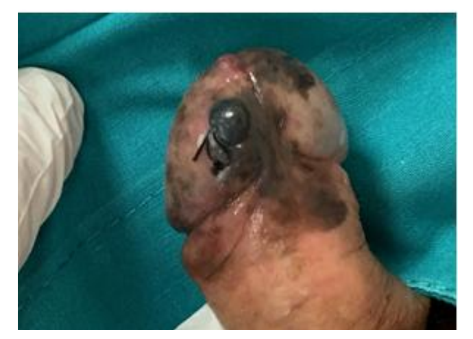
Fig1: Glanspenis melanoma

Because of this, a second biopsy was performed, reporting melanoma in situ , and the patient was referred to Urology (fig 1).