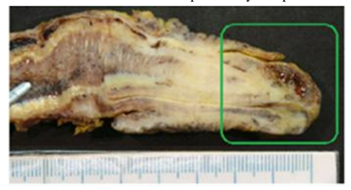
Fig2: Glas penismacroscopicslice

In addition, surgery is the first curative treatment option in localised tumours a priori [20] and complete removal of the primary lesion is the best prognostic factor for the patient's survival [21]. In our case, due to the pathological anatomy report of melanoma in situ , the curative treatment with radical surgery was chosen, consisting in the first stage of total penectomywith perineal urethrostomy (fig 2).