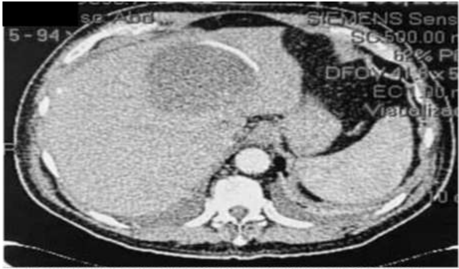
Image 4. Control tomographic image of liver abscess before second intervention.