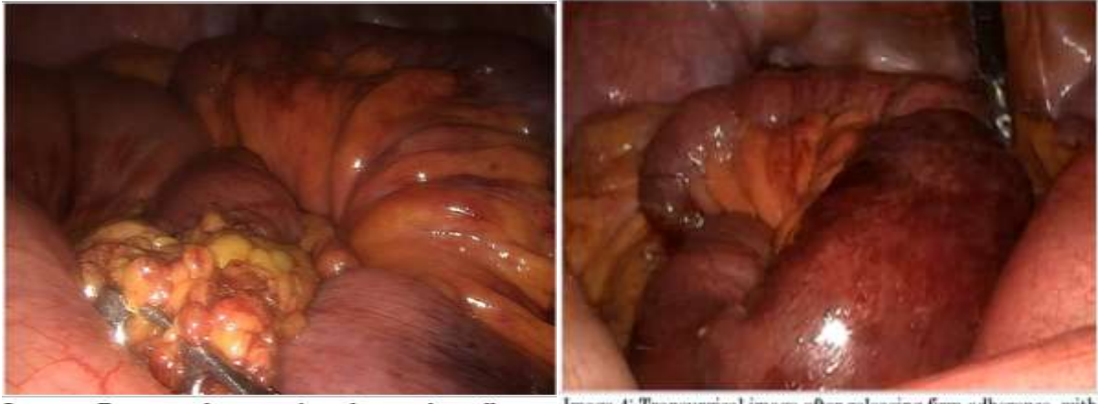
generating an intestinal transition zone.

Intestinal obstruction is one of the most common pathologies for consultation in the surgical emergency services. Being responsible for around 300,000 annual hospitalizations in north america. It is mainly caused by postsurgical adhesions, with a 70% prevalence: hernias of the abdominal wall and malignant tumors. Approximately 80% of patients with intestinal obstruction secondary to adhesions have a history of previous abdominal surgery. [1]