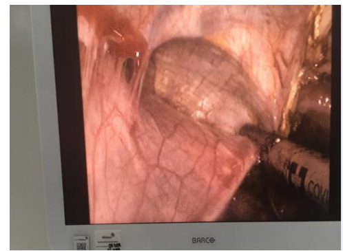
Figure6: Laparoscopic deroofing showing adherences to right hemidiafragm.