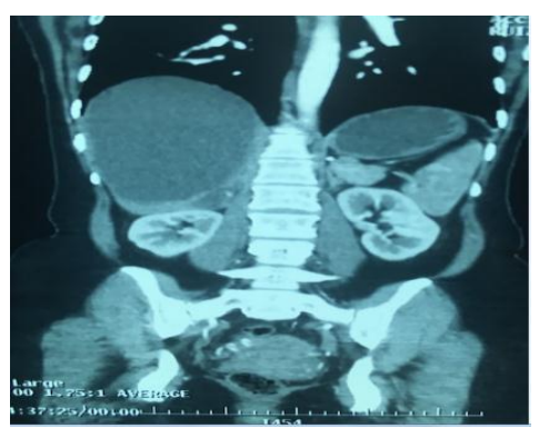
Figure3: CT scan with sagital view confirming posterior extensión of giant hepatic cyst.