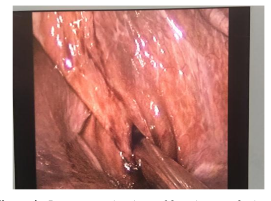
Figure4: Laparoscopic view of haptic cyst drainage of 3.5 liters of content.