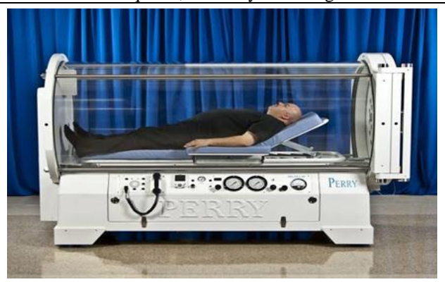
Figure 6. Hyperbaric oxygen therapy in Osteoradionecrosis