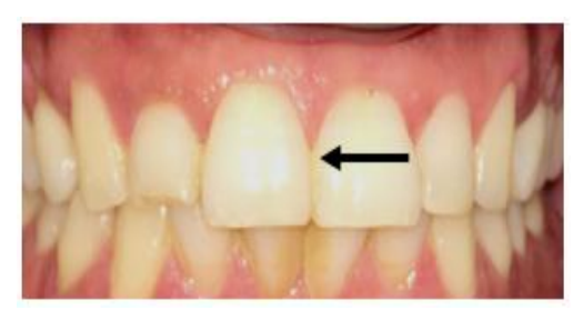
Figure11. Final result showing a complete papillary fill

Table2. The measurements of the papillary defect on day 1, 7 and 14 (Case 2)