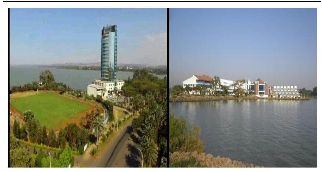
Figure 2. Grand resort and Spa Figure 3. Blue Nile Resort Source: Hotel's website, 2020 Source: Hotel's website, 2020