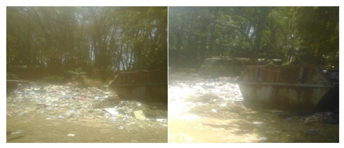
Figure 1. Pollution nearby Lake Tana