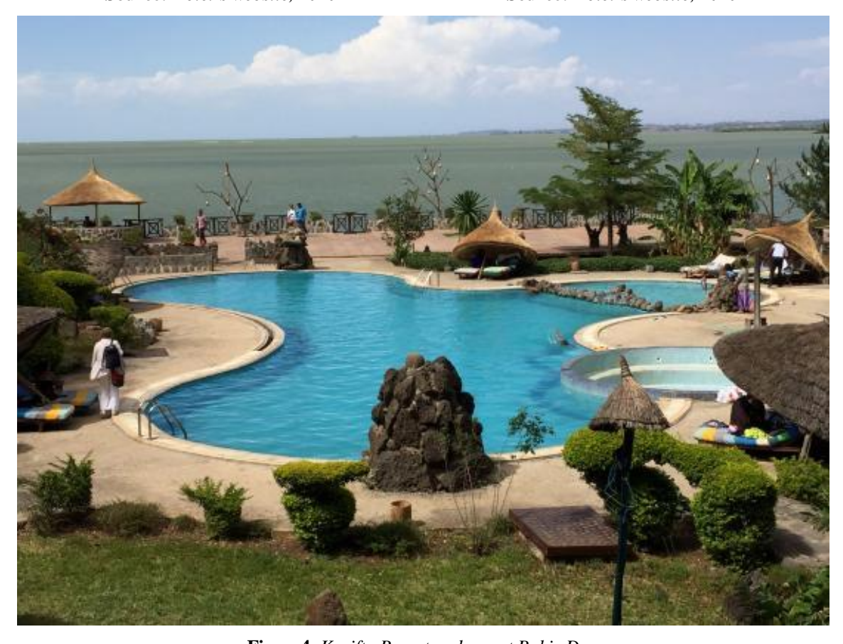
Figure 4. Kuriftu Resort and spa at Bahir Dar