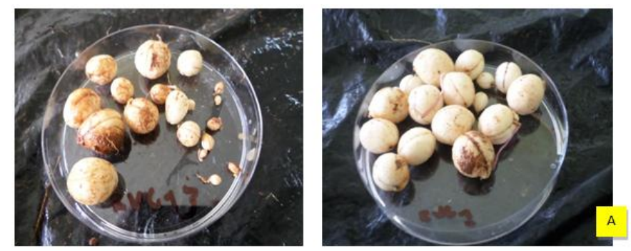
Figure 4. Pods produced by plants inoculated with (A) : RV13 and (B) : RVC1 International Journal of Research Studies in Microbiology and Biotechnology (IJRSMB)

Means in columns followed by the same letters are not significantly different at p < 0.05 (Tukey's HSD test). NG: number pods, PDM: pods dry mass, PlDM: plant dry mass