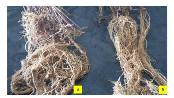
Figure3. Root systems of plants inoculated with (A) : RVC8 and (B) : Control International Journal of Research Studies in Microbiology and Biotechnology (IJRSMB)

Substantial gains in dry matter were observed in Vigna subterrenea plants grown in semi-sterile soil and inoculated with native Rhizobia from Daloa and S. meliloti. Indeed, more than 57 % of the strains isolated from Vigna subterrenea produced gains in dry matter, in their host plants, of more than 50 % compared to uninoculated plants. The native strains RVC13 and RVC14 were more efficient than the S. meliloti strain, the efficacy of which is similar to that of RVC8. These inoculants also led to a significant development of the root systems of the plants that received them, except for the RVC2 strain which induced a similar effect to that of the controls (Figure 3).