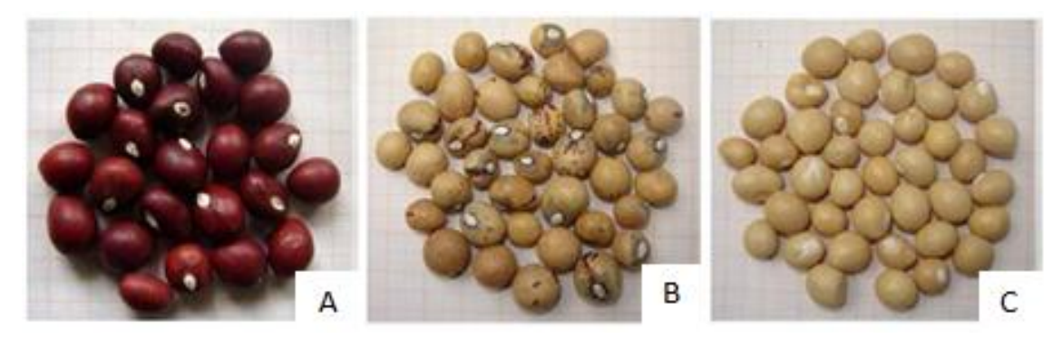
Figure 1. Seeds of Bambara groundnut used for this study: (A) Ci5, (B) Ci2 et (C) Ci1

The study was conducted in the experimental fields of the University Jean Lorougnon Guédé, Daloa, Côte d'Ivoire (6, 91° N, -6, 44° W). Three (03) variety of Bambara groundnut (Vigna subterranea L.) were used for the isolation (Figure 1). However, for the test of authentication, only the variety Ci5of Bambara groundnut was used to estimate the infectivity (ability to re-infect the host plant) and the efficiency (effectiveness in fixing atmospheric nitrogen) of fourteen (14) isolates and one (01) reference strain Sinorhizobium meliloti 1021. The 14 strains isolated in Daloa's soil, were coded RVC (Rhizobia of Vigna of Côte D'Ivoire). Each strain was grown on Yeast Extract Medium (YEM) liquid medium to logarithmic phase and a volume of 1mL of the bacterial broth inoculated to young plant of bambara groundnut old to 12 days, growing in plastic pots (three plants/pot) containing sterilized sand. As control, each block contained two pots (controls) that not inoculated [10]. Plants were supplied with water every two days. Forty-five days after inoculation, number and dry weight (mass) of nodules were recorded for evaluating the infectivity. Also the dry weight (mass) of the aboveground (aerial) part of the plant was recorded for evaluating the effectiveness that expressed in relative index.