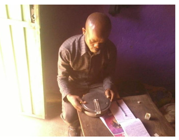
Figure3. Haematocrit reader

Haemoparasites affects the volume of cells by haemolysis which results in anaemia. Therefore, PCV will help to analyze the concentration of blood cells in the animals' body (Murray et al., 1983).