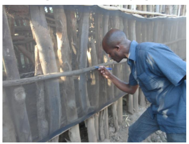
Figure. Experimental group

An experimental study was conducted to assess and check the effect of insecticide treated net on tsetse flies and other insects. During this experiment PCV values, defensive movements, milk yield and weight gain was measured for both experimental and control groups were used.