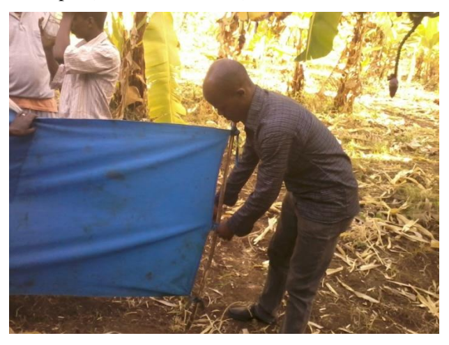
Figure2. NGU trap

Entomological monitoring was conducted to know the presence and densities of tsetse and other nuisance flies using 15 NG2G traps 10 for treated group and 5 for control group were baited with phenol and deployed at a distance of 5m away from treated and control pens. The attractant acetone was used by putting it under the trap stretched. The flies caught during the study were identified by and recorded. During this time 15 traps were deployed in shara kebele and flies were collected after 72hrs. The fly identification was based on their morphology of wing shape and their body size. The data collection was monthly. The pen allocated for the control group was left unfenced. The data obtained during the experiment was stored in the micro-soft excel spread sheet and the defensive movements, fly density, trypanosomosis prevalence, PCV, and persistence of the activity of the insecticide were analysed. The difference between experimental and control groups were compared to understand the effect of the deltamethrin-treated screen/net on the density of tsetse flies, tabanids and other nuisance flies around the pen(Machado A, 1954).