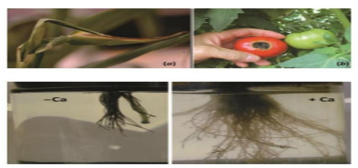
Figure 4. Calcium deficiency symptom

Calcium has little toxic effects on plants. Most of the problems caused by excess soil Ca are the result of secondary effects of high soil pH. Excess Ca may cause reduced uptake of other nutrients such as P, K, Mg, B, Cu, Fe, and Zn (Khan Towhid Osman, 2013).