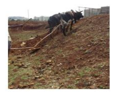
Figure 1. farming obstacle of stone quarrying