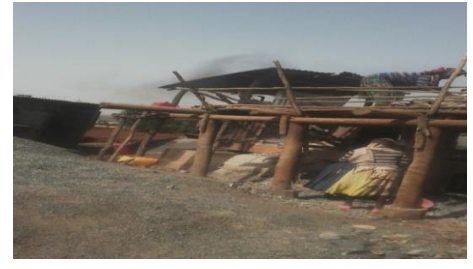
Figure6. impact of quarry on the the air

As we observed in the field survey smoke that released from stone crusher and burded stone the quarry worker used to blust stone easely by addind gasoil(figure 7).