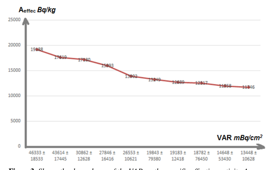
Figure3. Shows the dependence of the VAR on the specific effective activity- A_{\it effec.}

As can be seen from figure 2 with increasing specific activity of Ra226 in the soil and increases radon exhalation.