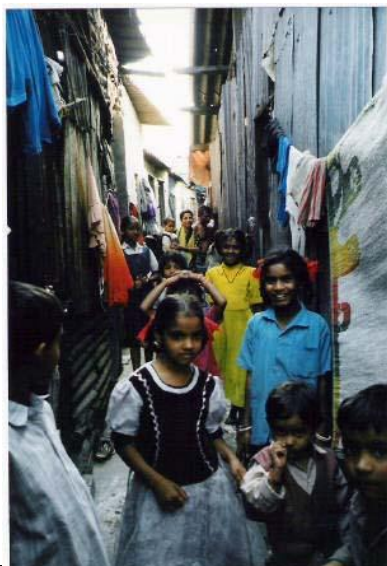
Pic-4. Lane in the study area

In short, the life of the residents were found to be very measurable having imposed congested houses, shortage of drinking water with unhygienic toilet facility, polluted and dirty smelled atmosphere. Besides, the study women were reluctant of availing treatment for their reproductive health problems during pregnancy including ANC, Child delivery, PNC and even child immunization.