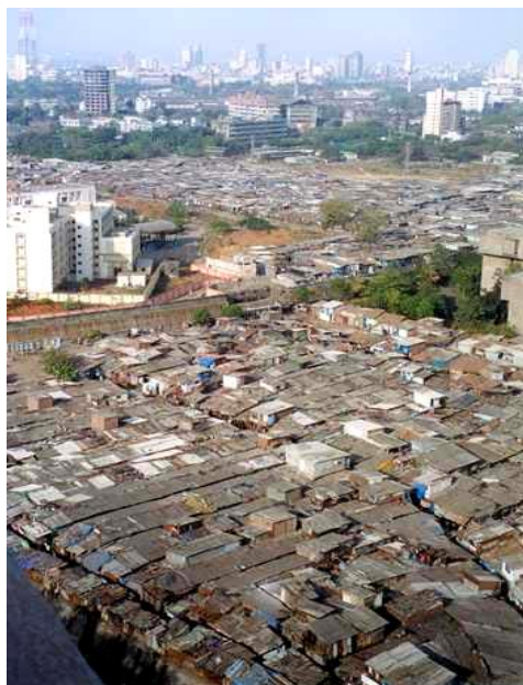
Pic-1. Profile of the study area

The slum sex ratio of M/East ward is 785. The female literacy rate is 67.49 as compared to male literacy rate of 82.9 which is quite below the national level (Census of India, 2001, Maharashtra population data with data on slum population in urban units).