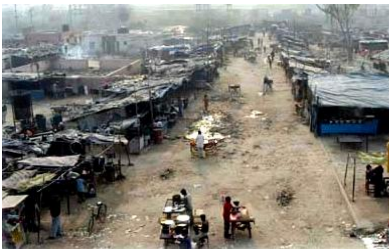
Pic-2. Environmental condition in study area

Rafi nagar slum was formed in the year 1970 with tenement size of 20. Normally, 4-5 families come together and then occupy such open land so called, 'dumping ground' which is being used by municipal corporations for accumulating garbage. Such group of families start living on such grounds by erecting 4 bamboos on four sides separated by 6-10 feet making an area of about 60-