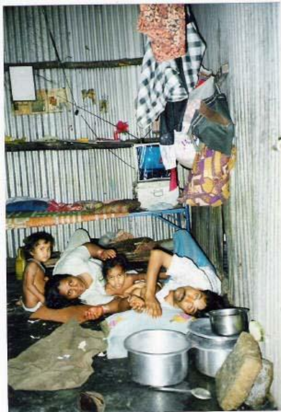
Pic-3. Housing condition in the study area

It was also found that the residents of this area cannot afford good medical facility, hygienic food, and reasonable sanitation as they are extremely poor. For the health services they prefer nearby Sub-Urban Health Centre located in the Lotus colony which is adjacent to the Shivaji nagar area and for the major ailments, they prefer to go to the Urban Health Centre (UHC) adopted by Nair Hospital, where full-fledged team of doctors and para-medical staff serve the community.