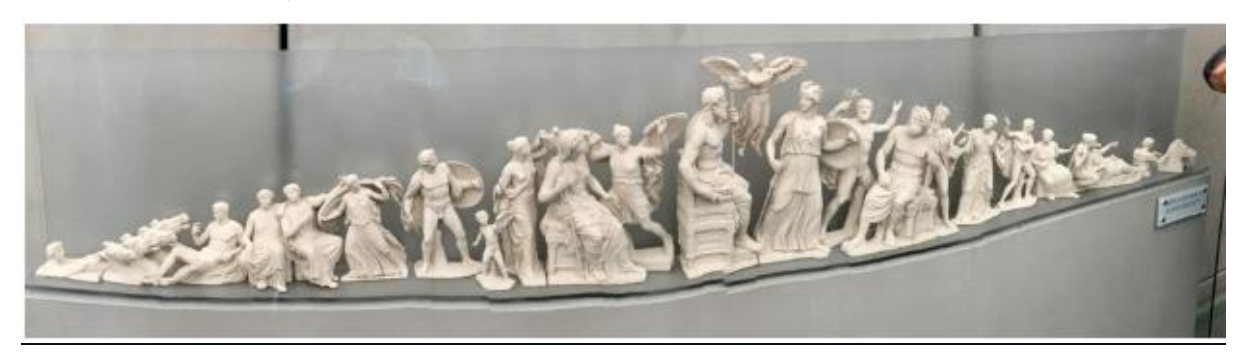
Fig5. (East Pediment of Parthenon)

Artist: Attributed to many artists, primarily Agoracritos and Phidias; Time Period: 432 BC