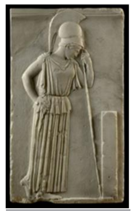
Fig4. (Marble Relief of Mourning Athena)