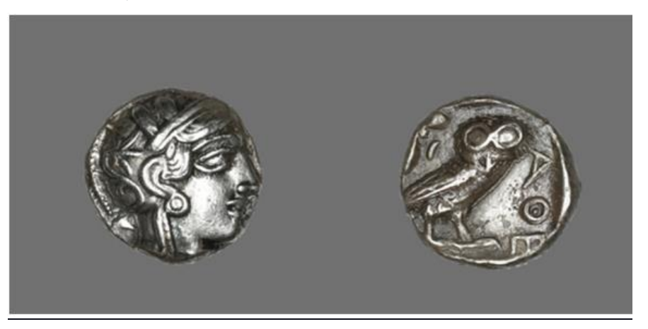
Fig2. (Tetradrachm Coin depicting the Goddess Athena)

Artist: Attributed to C Painter; Date: 570 - 565 B.C.