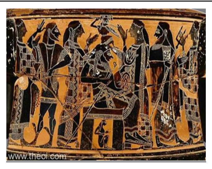
Figure 1. (Black Attic Ware Tripod)

Artist: Attributed to C Painter; Date: 570 - 565 B.C.