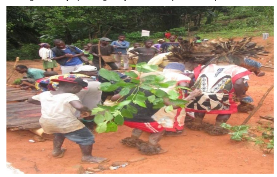
PictureII. Illustrating ndo'oto performing in a funeral at Bafui-Mbekunyam, Beba