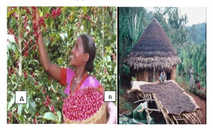
Figure3. Ripen coffee berry collection (A), Coffee berry dry processing method at household (B)

Shade tree regulation and pruning can reduce the populations of the borer by creating unfavorable environmental conditions, and also exposing them to attack by the natural enemies of the borer (Crowe and Tadesse, 1984). Coffee berries should be collected as soon as they ripen (picking should be carried out at least every two weeks during fruiting peaks and every month at other times).