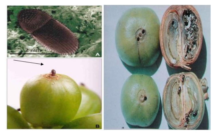
Figure1. Female of the CBB (a), female H. hampei penetrating a coffee berry (b) and galleries in berry (c)

In Eastern Africa countries, yield losses reported as high as 96% have resulted from coffee berry borer attack on coffee (Magina, 2005). In Kenya, infestation levels of up to 80% have been reported (Masaba et al. , 1985) and the pest is reported to contribute to an on-going decline in coffee production in the country. So as to manage these pests, particularly the coffee insect pests, researchers in the past have tried to identify and develop effective, economic acceptable and sustainable pest control strategies. In Ethiopia the pest also causes significant damage both on left over the tree and fallen berries (Chemeda et al. , 2011).