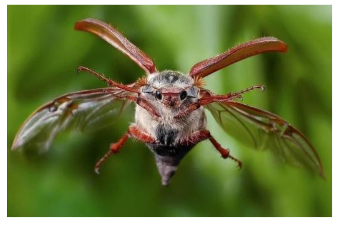
Figure1. May beetle in flight

According to the laws of modern physics and aerodynamics, the beetle should not fly. The wing area is too small in relation to the body weight of the insect itself. In order to fly, the May beetle, with an average mass of 9 g, must have a lift coefficient of 2 to 3. In fact, this insect has a lift coefficient of less than one! The flight of the beetle (Figure 1) has been the topic of special research.