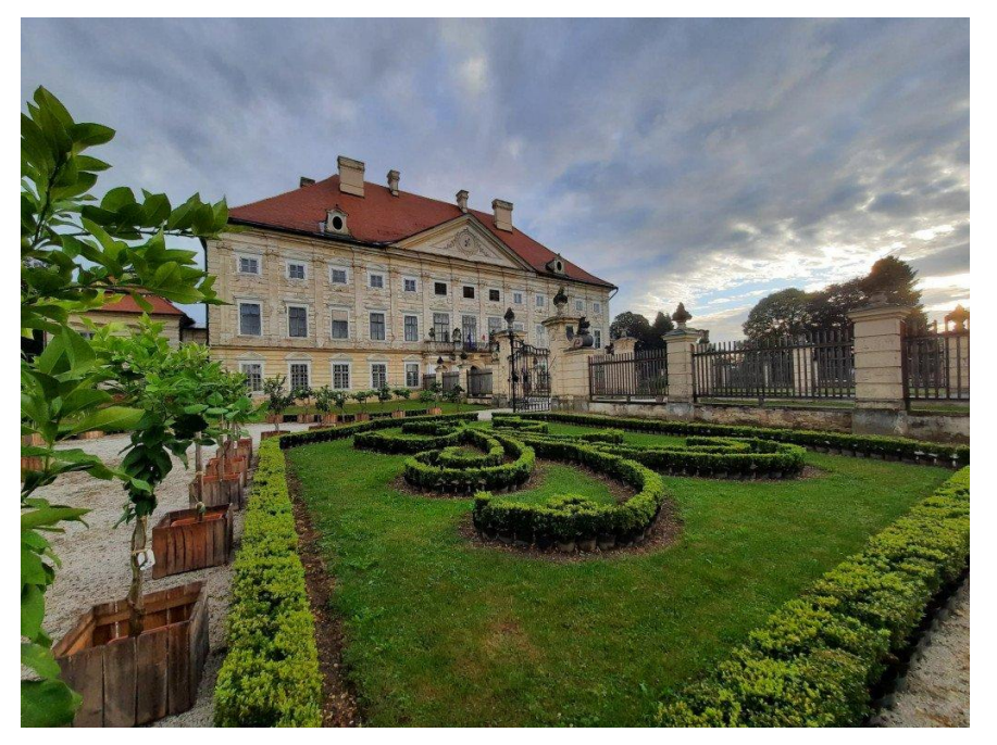
Figure 2. Dvorec Dornava (Dornava mansion)

This fragment is dedicated to Dvorec Dornava (Dornava mansion), Podravje, Slovenija (Slovenia) to shield the new Pharmacy Springer in Dornava with beauty.