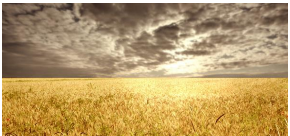
Figure2. God's providence [4] REFERENCES