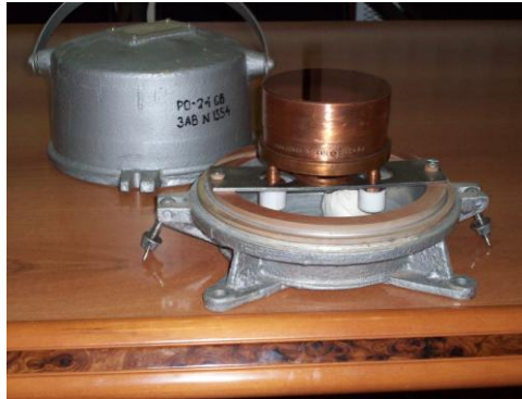
Figure 5. High power water cooled mirror with protective case of USSR.

Besides, there arises also a ‘childish’ question: If the laser beam can be focused and directed by a mirror, why cannot the same mirror protect us from the laser beam? In lasers use is usually made of multilayer dielectric mirrors that can reflect very much – but in a very narrow range and only under strictly defined angles. In addition, they are cooled, which is impossible to do with the entire surface of the target. In other words, simple, effective and affordable protection from high-power lasers does not exist.