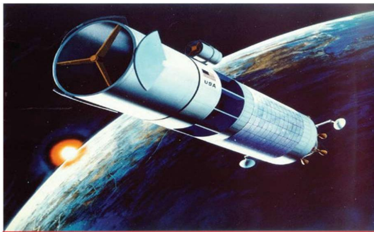
Figure7. Sketch of space based laser system.

In fact, one shot of the ABL costs 10 thousand USD, whereas the domestic 16 million rubles are the propaganda and exaggeration. This is comparable with the cost of a Fagot anti-tank guided-missile system. More complex anti-tank guided-missiles cost tens of thousands of dollars; for example, a Maverick air-to-ground missile for hitting targets ranging from a distance of a few thousand feet to 13 nautical miles at medium altitude costs 154 thousand USD, a Patriot missile – 3.8 million USD. The cost of a shot from tactical lasers is less than from the ABL. Even in a hydrogen fluoride THEL it was 2-3 thousand USD; in this case, the laser used not hydrogen but deuterium which is quite expensive.