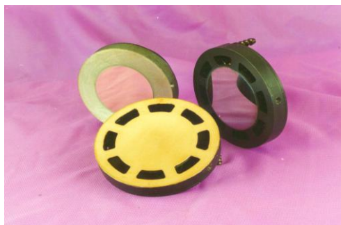
Figure4. Different constructions of low power laser mirrors.

Yet another malapropism. Indeed, some metals may have near-100% reflection coefficients. First, however, these coefficients are not equal 100%. Thus, at a wavelength of 1 \mu\text{m} the reflection coefficient drops to 75% for most structural metals. A real missile after its launch will be also significantly contaminated with combustion products. Meanwhile, modern 'hyperboloids' emit light in the vicinity of 1 \mu\text{m} (the ABL has a wavelength of 1.315 \mu\text{m} ). In this case, 25% of hundreds of kilowatts will be sufficient even in the cw regime to heat up and melt down the thin skin layer of the missile. Thus, reflectivity will decrease because the absorption of laser radiation increases rapidly with increasing temperature, and abruptly jumps after the start of melting. In the pulse-periodic regime the situation is even more favorable.