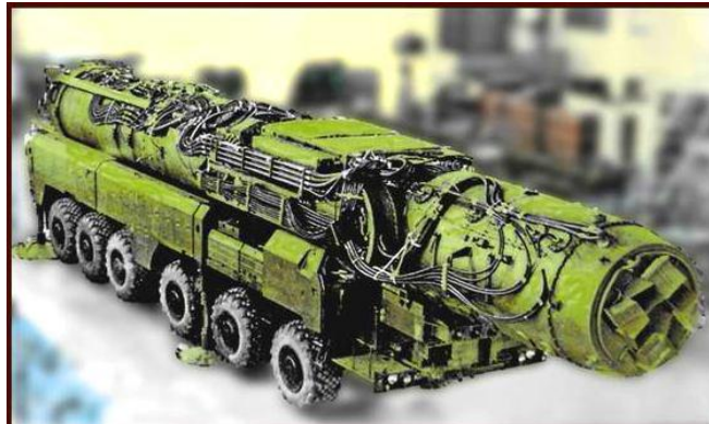
Figure3. Mobile laser system of USSR.

the effects of atmospheric turbulence and laser path on the transmitted beam. In addition, the lasers of the same class are radically reduced in size. The first version of a THEL weighed 180 tons and could be hardly installed into six trailers. The laser used a hydrogen–fluoride mixture which is very unfriendly to the environment. The second generation of advanced tactical lasers (ATLs) relies on oxygen–iodine mixtures [so called chemical oxygen–iodine lasers (COILs)] and is more compact. Finally, a new solid-state laser of Northrop Grumman weighs 1.5 tons, including the cooling system. In the future its weight is expected to be reduced to 750 kg. As a result, the land based version of the system consists of a heavy expanded mobility tactical truck (HEMTT A3), command post on a high mobility multipurpose wheeled vehicle and a towed single-axle trailer with the AN/MPQ-64 radar. At the same time, the U.S. works hard to convert the CW regime of the lasers in the pulse-periodic one, which will dramatically increase their range of actions.