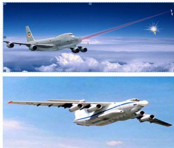
Figure1. Anti-missile airborne lasers : USA and USSR