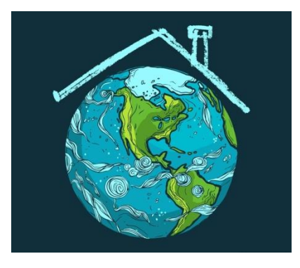
Fig2. Staying home

This fragment was written during the coronavirus pandemic. So it is dedicated to Nobility of staying home.