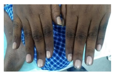
Figure 1. Pallor of nail beds

Dapsone was withdrawn and other MDT were continued. 3 units of O+ve blood transfusion was done. One course of cefriazone and antipyretics was given.