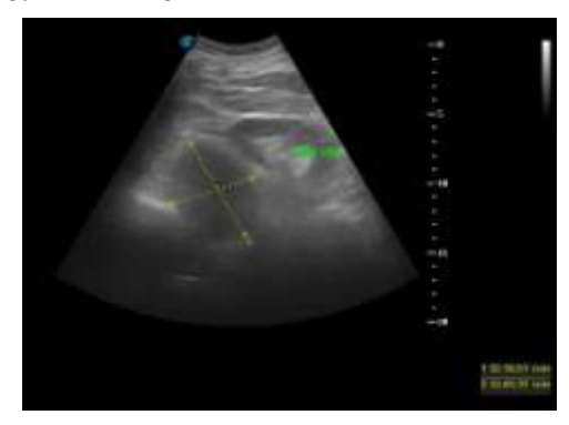
Figure1. Abdominal ultrasound examination revealing a hypoechogenic formation above and in front of the left kidney.

evaluation of increased serum creatinine (to 162 mcmol/l) and uric acid levels (to 452 mcmol/l). The patient had long-standing history of gout, on treatment with Colchicine 0.5 mg bid. At the admission the patient had acute gout arthritis of the right knee. The clinical-laboratory investigations demonstrated high total cholesterol of 6.15mmol/l, high uric acid of 452 mcmol/l and borderline serum creatinine of 107 mcmol//l. The routine abdominal ultrasound revealed cholelithiasis examination and formation 76/61 mm above and in front of the left kidney (figure 1). Both kidneys had normal ultrasound appearance.