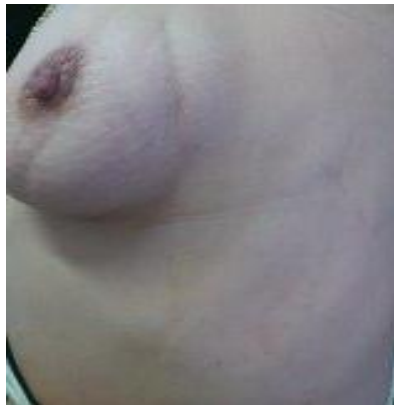
Fig1. palpable and painful cord-like in duration on her left breast

A 47-year-old woman presented to us with palpable and painful cord-like in duration on her left breast. Few days later she developed a similar lesion affecting her left thoracoepigastric vein (Fig 1). She was smoker and has a family history ok stroke but there was no history of trauma or malignancies. Bilateral mammographic examination was normal. Ultrasonographic examination showed a hypoechoic tubular structure (Fig 2) Laboratory investigations including a thrombophilia study and anticardiolipin antibodies were within normal range. Liver test revealed a light elevation of transaminases levels. Hepatitis C antibodies were positive. The patient was diagnosed as having Mondor`s disease on the basis of these findings and after 5 months of treatment with pentoxiphilline 600 twice, lesions have partially regressed.