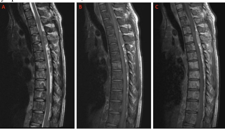
Figure1. Saggital MR images. (A) T2 weighted images showing extensive extraosseous soft tissue spread of disease involving the epidural, foraminal, and paraspinal soft tissues of the lower cervical, thoracic, and lumbar spine with multifocal areas of spinal cord compression and displacement, greatest at the T4 and T5 levels where there was moderate to severe cord compression and abnormal T2 hyperintense cord edema (A) extending caudally to the stenosis, seen greatest at the T3-T4 level. There was also moderate to severe spinal canal narrowing at T10-T11 without cord signal abnormality. (B) T1 weighted pre-contrast (C) T1 weighted post-contrast images show that the lesions are enhancing.

was extensive extraosseous soft tissue spread of disease involving the epidural, foraminal, and paraspinal soft tissues involving the lower cervical, thoracic, and lumbar spine with multifocal areas of spinal cord compression and displacement, greatest at the T4 and T5 levels where there was moderate to severe cord compression and abnormal T2 hyperintense cord edema extending caudally to the stenosis, seen greatest at the T3-T4 level. There was also moderate to severe spinal canal narrowing at T10-T11 without cord signal abnormality. The constellation of findings was most suspicious for lymphoma or leukemia with extraosseous extension.