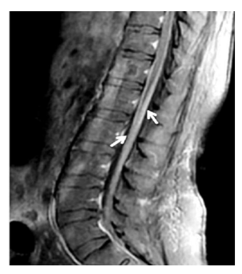
Figure1 . Sagittal Fat-Sat T1- weighted image gadolinium contrast of lumbar spine demonstrates a thickening and enhancement of nerve roots of cauda equina.

Thus, the axial T2 weighted MRI image through the dorsal spine revealed a hypersignal at the level of posterior basal segments of lungs. A coronal STIR weighted MRI image was